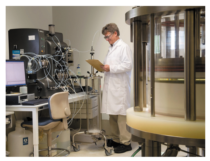
The advent of mixed-mode and multimode media and the increased selectivity they offer presents significant potential operational cost savings by eliminating intermediate purification steps that require additional time, materials, equipment and personnel.

There is also a greater focus on the use of additives to improve buffer performance. For example, in hydrophobic interaction chromatography (HIC), bioprocessors are working to fine-tune the selectivity of HIC functional groups. One method being explored is to use a select range of additives in the chromatographic media to improve the retention and selectivity of proteins as they move through the media, modulating their hydrophobic interaction and improving separation efficiency with decreased retention time, thereby improving throughput.