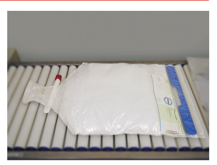
"Buffer-on-demand" programmes can eliminate buffer-related costs in terms of labour, time and capital expenses from downstream production. Buffers are supplied in singleuse packages – either pre-weighed and ready to use in solution, or as concentrates that can be diluted and used in columns.

This approach could enable a biologics manufacturer to more accurately assess and predict the process performance of any given raw material ahead of its use. This is a more holistic and data-driven way to assess the total impact of other downstream optimisation steps, such as adopting more targeted resins or implementing the use of novel additives in buffers.