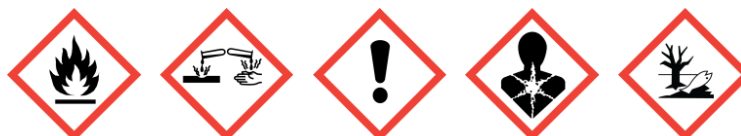
GHS02 GHS05 GHS07 GHS08 GHS09